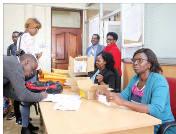
Students Recruitment and Admissions members of staff attend to students.