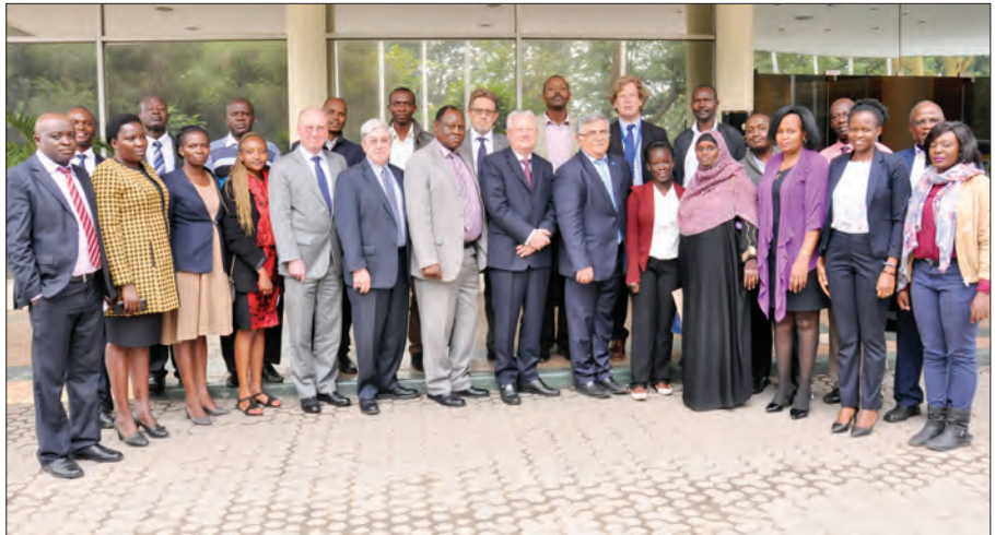
Representatives from various institutions after the conference on ICT.

In Kenya, ISTC will be involved in capacity building, training of staff and sharing the experiences to help them take little time than they did in the past, because of technology advancements.