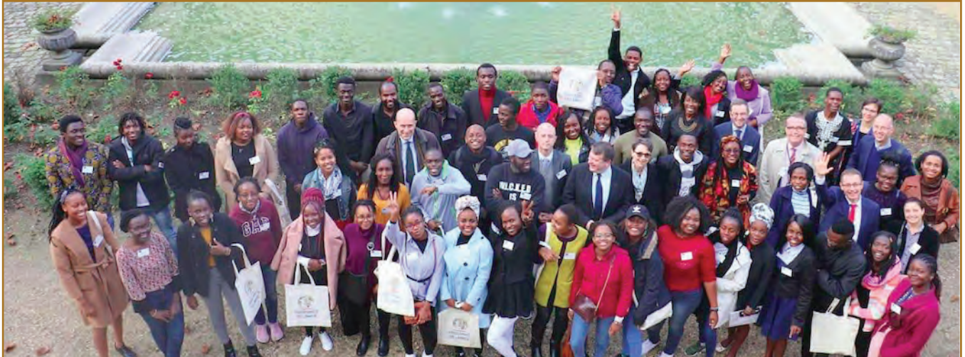
Participants during the official launch of 'English Language Assistants from Kenya' programme. The programme will see 59 Kenyan university students who have at least completed second year studies teach English language in French primary and high schools. TU-K has sent three students.