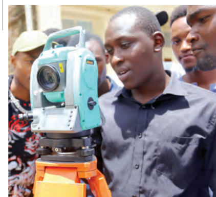
Geospatial experts speak to students during the School of Surveying and Geospatial Science symposium and expo.