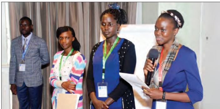
Some of the researchers making presentation during the workshop.