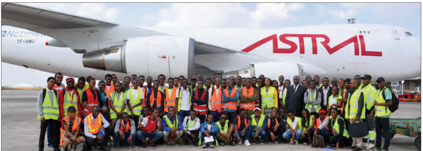
TU-K Aerospace and Aviation Engineering students pose for a picture with staff and technical and training teams from various hangars during their tour of Jomo Kenyatta International Airport (JKIA).

The students had the rare opportunity to see and learn about KQ's biggest passenger aircraft, a Jumbo Jet (B747-300) with four engines and ten undercarriages.