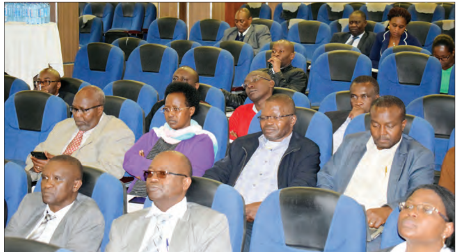
A section of the faculty follow proceedings at the College of Insurance, South C

Some of the topical areas the symposium deliberated on included; overview of reforms in education and training conducted by Curriculum Development, Assessment and Certification Council Secretariat that extended to procedures for competency based curriculum development, assessment standards and certification. The symposium also discussed the implementation of competency based