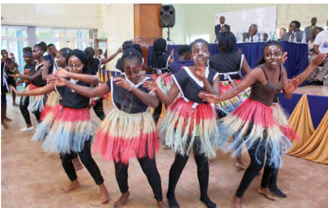
University students choir members perform during Culture Week opening ceremony.