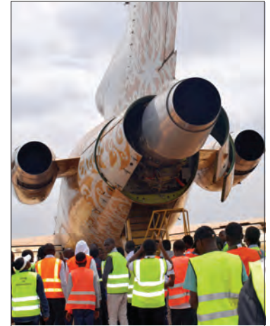
Students being taken through sections of aircraft operations and maintenance procedures.

Under the supervision of two senior engineers, the students boarded an aircraft by Safe Air and had a view of the avionics. Mr Achote took them through the refueling process using hydrant pit valve system and pressurization. The tour covered the entire terminals including Terminal One-Popularly known