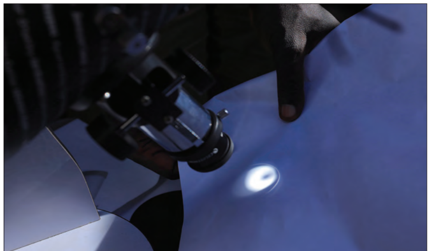
Planet Mercury transition in front of the Sun is observed using an 8-inch Digital Celestron telescope.