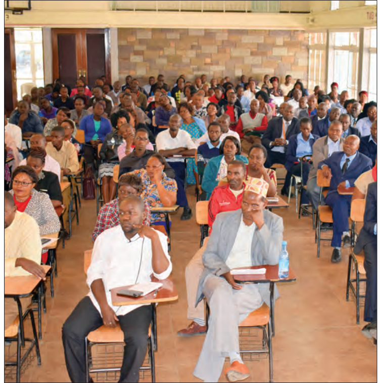
University support staff follow proceedings during the meeting with VC.