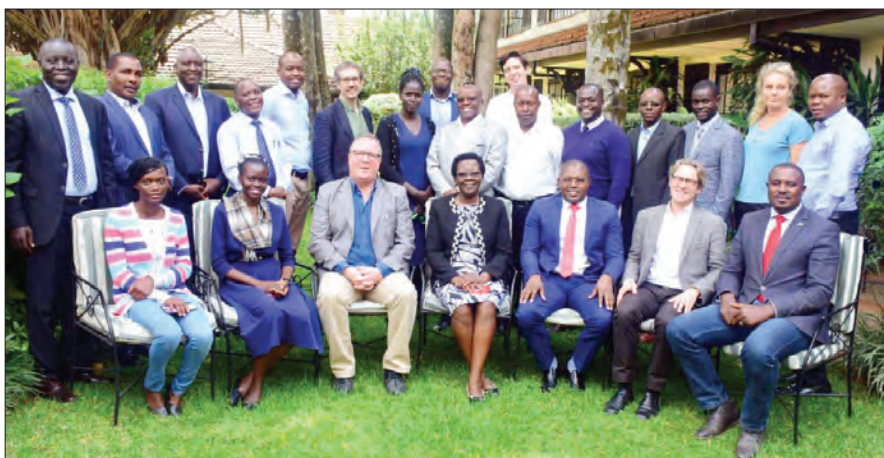
Experts and scholars in Water, Sanitation and Hygiene (WaSH) joint research project drawn from TU-K, Royal Institute of Technology (KTH) and the Stockholm International Water Institute (SIWI) during a workshop held at Southern Sun Hotel, Nairobi.

The workshop proposed solutions to misalignments including; working close with communities to reduce vandalism and resistance from users, and to build trust through signing MoU's education and understanding users.