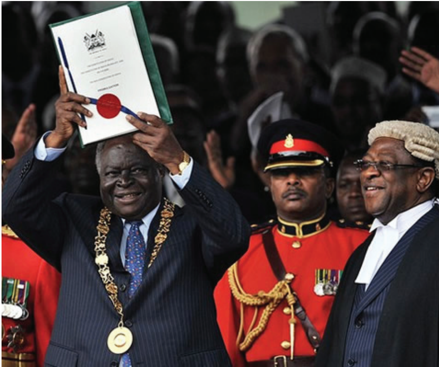
Former President Kibaki during the unveiling of the new Constitution